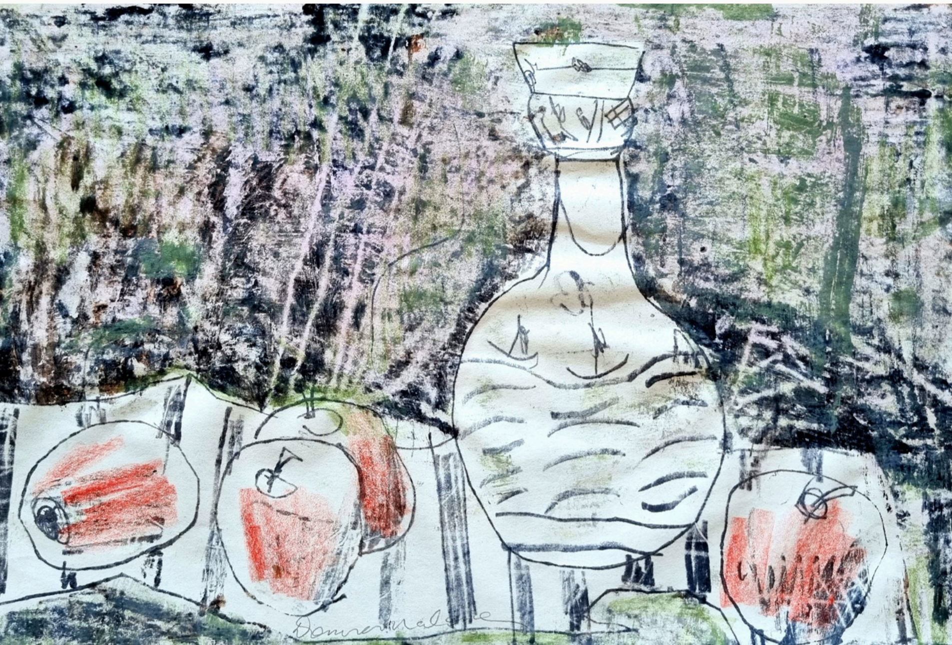
'Margaret's Special Things' oil monotypes – 29 x 21 cm